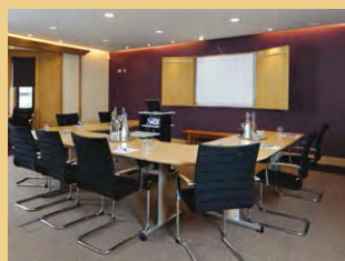
The Common Room Light and airy, ideal for small meetings, enjoying breathtaking views over the Cathedral.