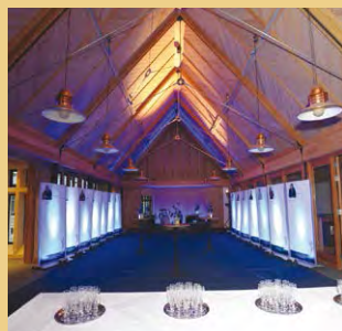
The Kentish Barn Versatile and spacious with scope for dividing into two smaller meeting areas.