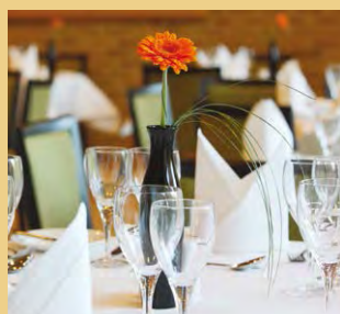
Refectory Restaurant Modern and spacious, ideal for a variety of dining options with direct access to a terrace and garden.