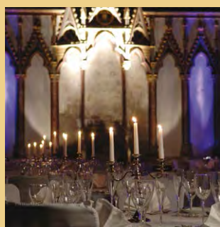
Chapter House An exceptional and magnificent venue dating back to the 14th century lending distinction to grand banquets and receptions.